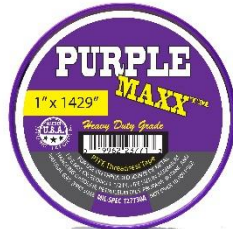
Purple Maxx™ Tape Heavy-Duty all-purpose tape rated to 10,000 psi