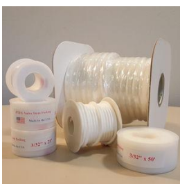
Expanded PTFE Valve Stem Packing Soft, round, conformable PTFE – ideal for packing small valves and for use as gasketing