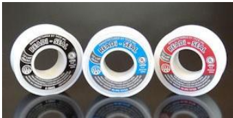
White Thread Seal Tape 3 USA-made grades plus an imported grade