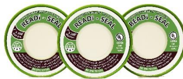
Green Oxygen Tape Premium Density Oxygen Service tape meeting Mil Spec A-A-58092