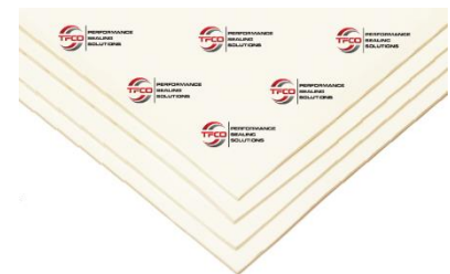
Expanded PTFE Sheet Soft, conformable gasket sheet - 60"x60" x 1/16", 1/8" & 1/4" thick