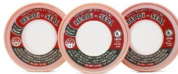
Pink Plumbers Tape Heavy-Duty 10,000 psi Tape for Water and Steam Lines