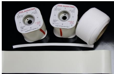
Expanded PTFE Gasket Tape Soft Gasket Tape for large flanges, and for punching small gaskets and washers