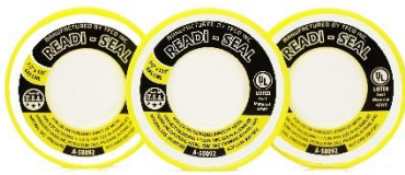
Yellow Gas Line Tape Full Density Yellow tape made specifically for gas lines