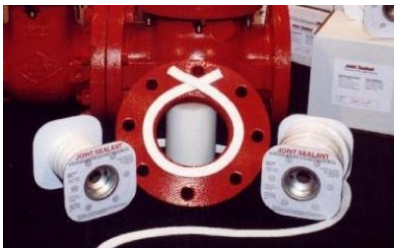
Expanded PTFE Joint Sealant Soft, conformable flange gasketing material rated to 3,000 psi