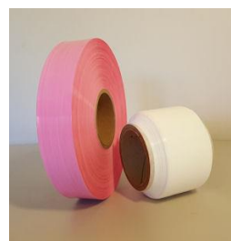
Unsintered PTFE Specialty Tape Full and Low-Density, unsintered PTFE tapes and films in a variety of widths, thicknesses and colors